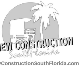
A - South