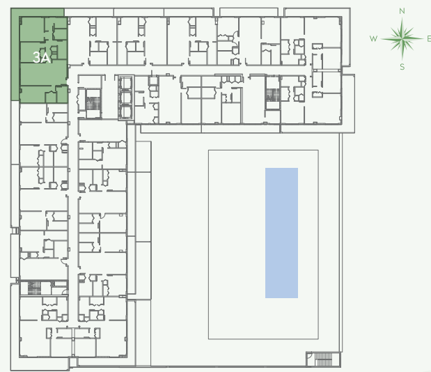
Key Plan of floors 6 & 7.