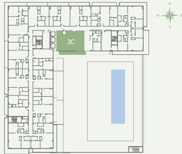
Key Plan of floors 6 & 7.